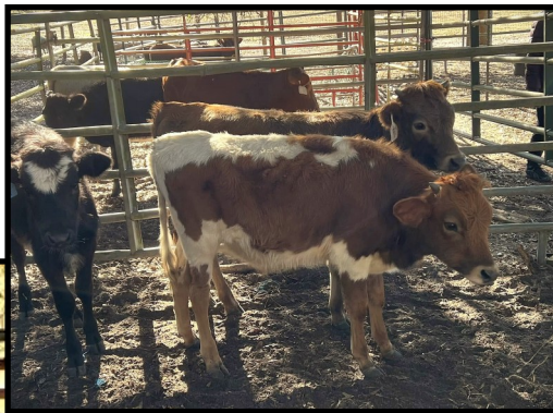
Cattle waiting to be herded!