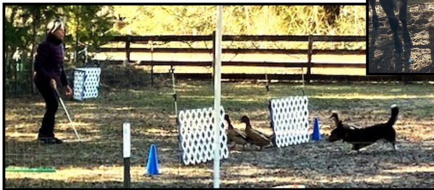
The other type of corgi!